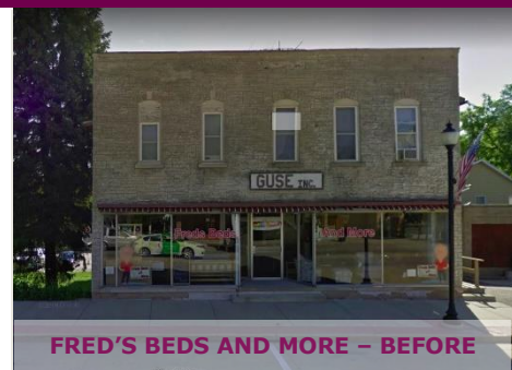
FRED'S BEDS AND MORE – BEFORE