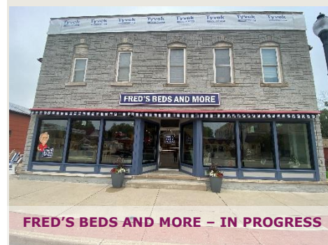
FRED'S BEDS AND MORE – IN PROGRESS