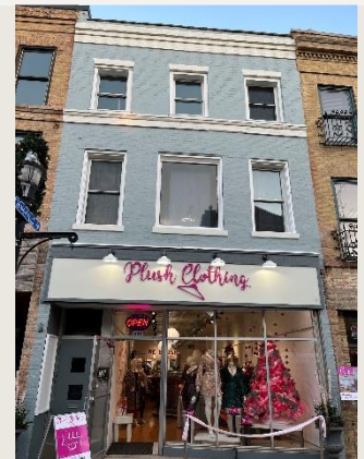
PLUSH CLOTHING - AFTER