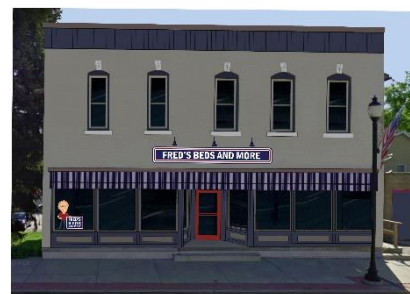
FRED'S BEDS AND MORE – FAÇADE RENDERING