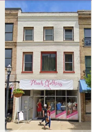
PLUSH CLOTHING - BEFORE